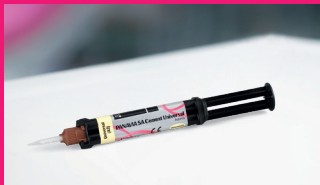
Room temperature storage