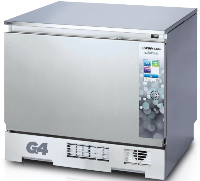
HYDR/M C61W G4 also available