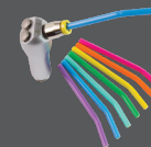
Seal-Tight™ Disposable Air/ Water Syringe Tips

To view a list of all products that qualify for double reward points visit loyalty.kerrdental.com