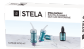
STELA CAPSULES INTRO KIT - 8640004 10 CAPS, STELA PRIMER 5mL

*Conditions apply - Must be returned unopened within 30 days from date of invoice. Limited to 1 trial per clinic.