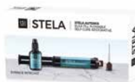
STELA AUTOMIX INTRO KIT - 8640002 1x 8g SYR, STELA PRIMER 5mL

If you are not 100% satisfied return the unopened product for a full refund.